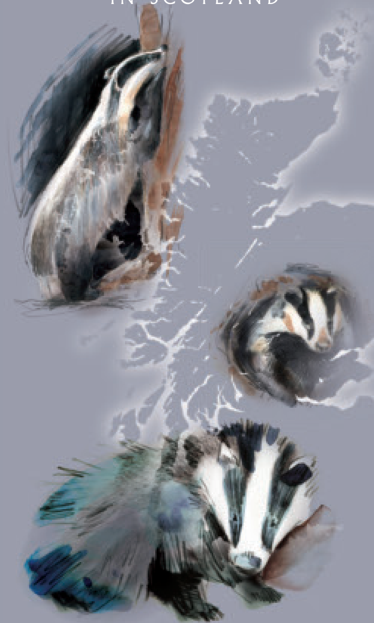
Designed and produced by RANDAK Design Consultants, Glasgow © 2005